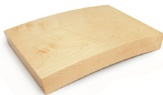
Geopanel Symfonia I Reflective Panel