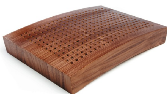
Geopanel Symfonia II Absorptive Panel